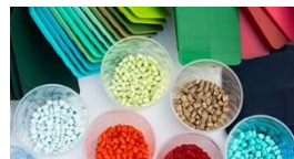
Resin (Unsaturated Polyester Resin, Alkyd Resin)