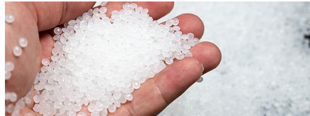
Polymers and Raw Materials