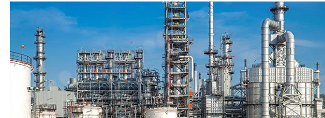
Refined Petroleum Products