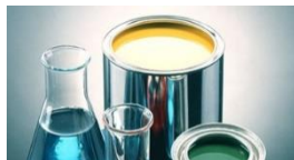
Paint and Coating

Our products find application in various Industries, and key end-use Industries Served are listed here: