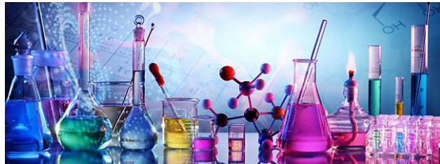
Chemicals and Petrochemicals

We are dealing in various chemical and petrochemical products which find application in various end use industries including Paint and Coating, Resin (Unsaturated Polyester Resin, Alkyd Resin), Building & Construction, Oil and Gas, Printing Inks, Water Treatment, Lubricants, Polymers, Paper and Packaging, Pharmaceutical, Cosmetics, Flavours & Fragrances, and Emulsions. Some of the Key products which we deal in are as here under.