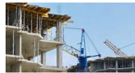
Building & Construction