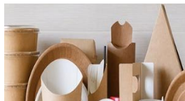
Paper & Packaging