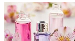
Flavours & Fragrances